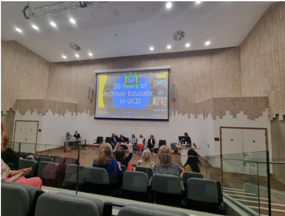
Photo: Image of the Anniversary Seminar June 2023

The video was first shown as part of a hybrid seminar held in Belfield in June 2023. This seminar, which was the second part of the birthday celebrations, was open to all former graduates, staff, and friends of the archival education programmes.